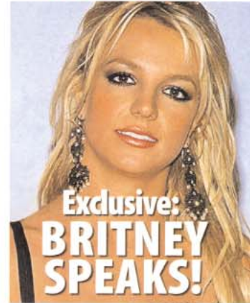
Exclusive: BRITNEY SPEAKS!