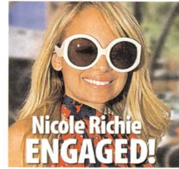
Nicole Richie ENGAGED!